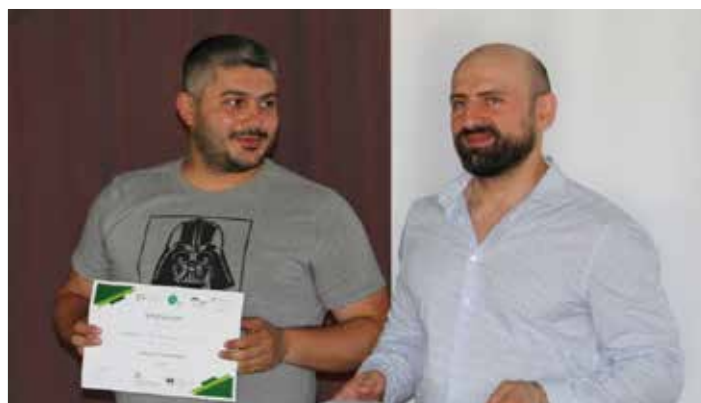
Training of stove producers

Additionally, during the training experienced and new stove producers exchanged their knowledge and experience. They discussed potential challenges and needs for EE stove production, including increased prices and technical features established by the standards. The training participants evaluated the sessions as very useful and pro-