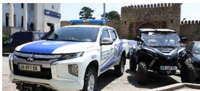
DEC machinery and equipment exhibited for the meeting participants

The information meetings were organized in all eight target municipalities of the ECO.Georgia project over the last three months.