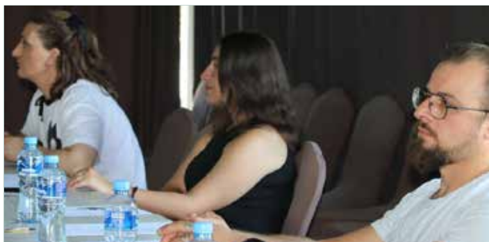
Training of stove producers

During the training sessions, the producers also learned about the co-financing program for energy-efficient stoves administered by the Rural Development Agency, including the requirements and advantages of participating in the program.